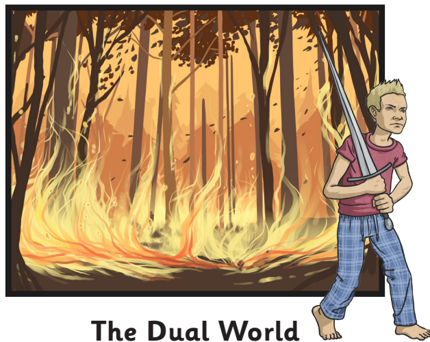
The Dual World of Anders Arnfield

Sample 2016 Key Stage 2 English Reading Booklet - Fiction